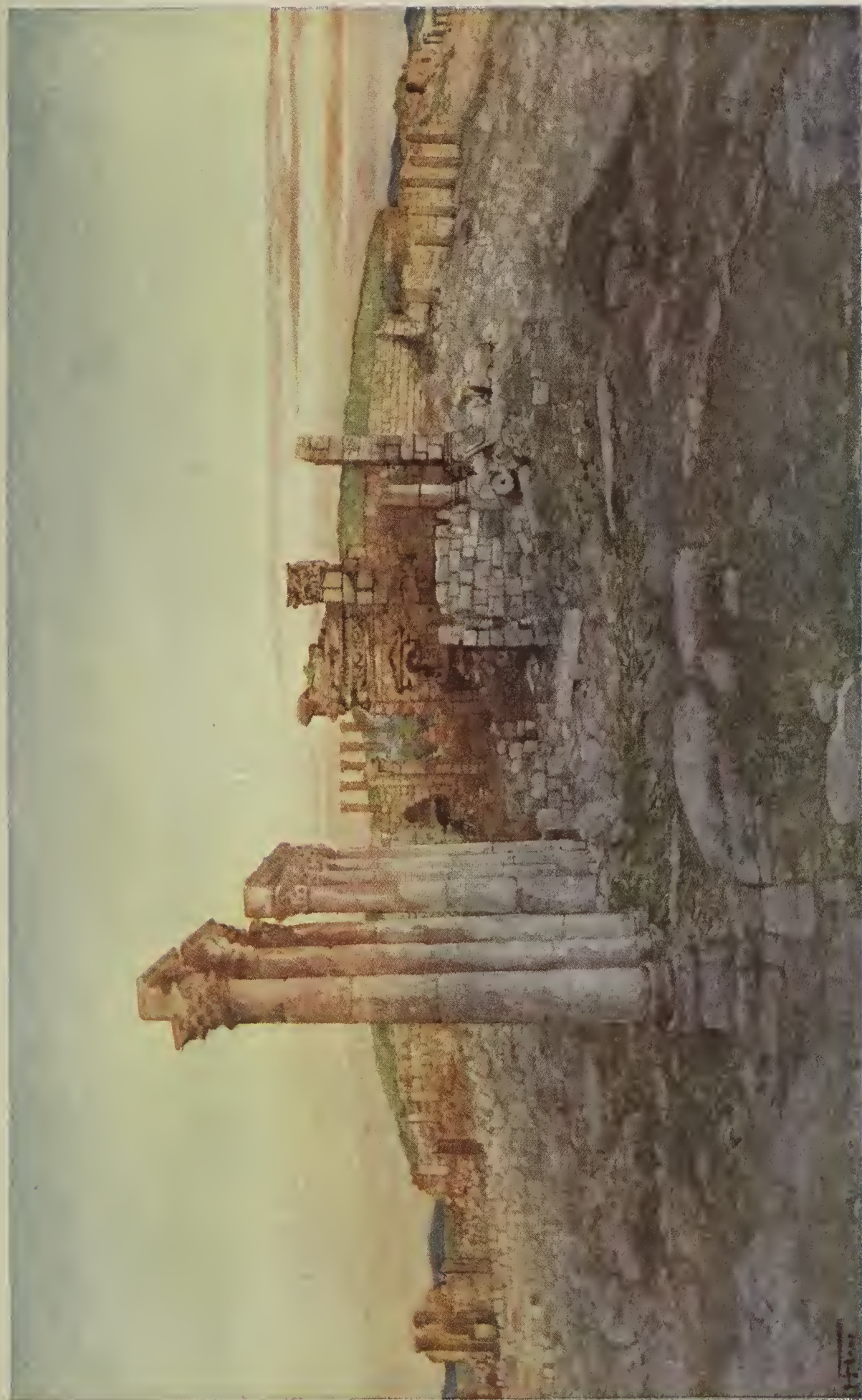
Ruins of Jerash, Looking West. Propylæum and Temple terrace.